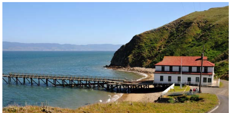
Longer, heavier motorized lifeboats were launched via exterior rails by four-person crews.

In 1890, the Point Reyes Life-Saving Station opened with a crew of eight and a seasoned keeper on a lonely stretch of Great Beach known for its notorious pounding surf and bad weather. Their positions were poorly paid, difficult, and full of danger. The surfmen patrolled the beaches of Point Reyes with an ever-vigilant eye, looking for shipwrecks and their desperate crews. They walked the beaches day and night, with the fog chilling them to the bone and the wind blasting sand at the unprotected skin of their faces. The boats stationed in Marin saved hundreds over the years as mariners slammed into rugged rocks along the West Marin coast.