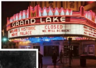
Oakland's Grand Lake Theater in 2020 & Los Angeles mayor closes theaters.