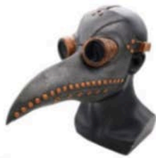
A 2020 replica of the 14 th Century Plague Doctor mask.