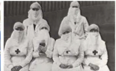
Hospital staff, 2020 and 1918.