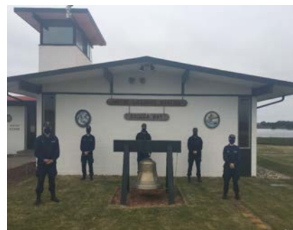
Station Bodega Bay members sporting new face masks provided by Div 5.