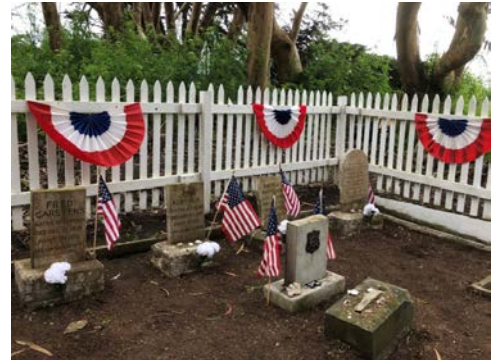
Historic Life-Saving Service Cemetery at G Ranch