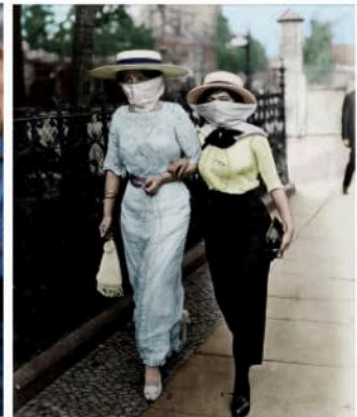
Checking for Coronavirus updates in 2020 and strolling a NYC street in 1918.