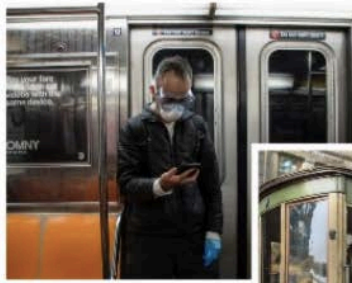
Subway-riders in 2020 (Business Insider) and in 1918 (National Archive).

Two pandemics, 102 years apart, striking similarities; 1918 and 2020.