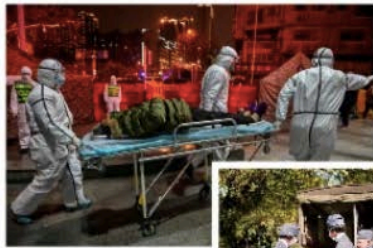
Medical personnel in 2020 and 1918.