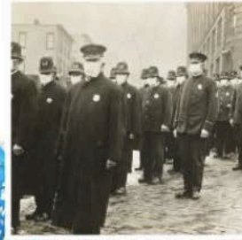
Seattle police officers in 1918 and NYPD in 2020.