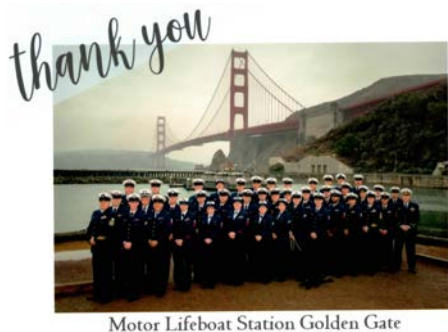
Motor Lifeboat Station Golden Gate