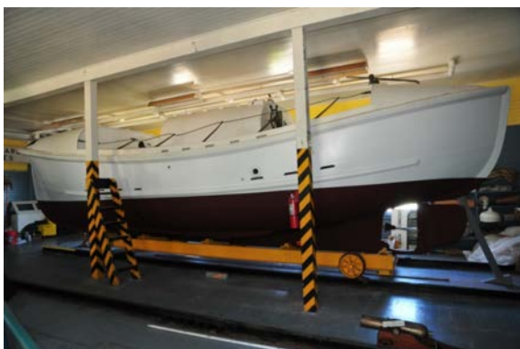
Point Reyes--Motor Lifeboat 36542 restored and on display inside the Chimney Rock boathouse.