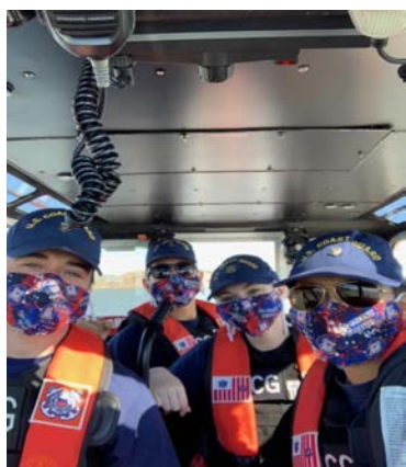
Station Vallejo Crew aboard 25-foot Safe Boat sporting Div. 5 masks