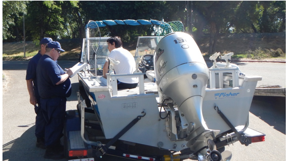
VE station

A week before our event, the CHP were also scheduled to perform a 'Rescue Swimmer Demonstration' with Sacramento Fire, but CHP were also dispatched to a call before they were even close to the event site. (Coast Guard saved the day!) A C-27 from Air Station Sacramento was the beginning of the on the Water Demonstrations, followed by a Rescue Swimmer Helicopter from Air Station San Francisco.