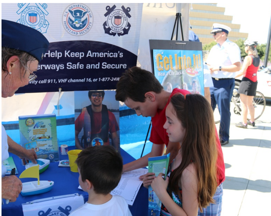
Display with educational material was well attended.