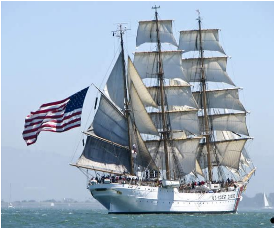
USCG Eagle under full sails.

The first time I ever saw the WIX EAGLE was on 4 July 1976. My wife and I were perched atop the 33rd floor of the Merrill Lynch building in lower Manhattan. With our noses pressed firmly against the windows, we were readying for the Parade of Ships commemorating the 200th birthday of our great nation. From our vantage point, we had a 270-degree panoramic view of the New York harbor resplendent with the Verrazano Narrows bridge, the Statue of Liberty, Ellis Island, Governor's Island and the greater harbor. It was beautiful as well as exciting.