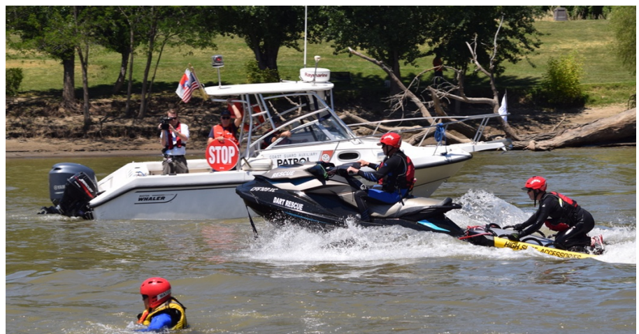
Auxiliary Vessel conducting 'Traffic Brake' for D.A.R.T [Drowning Accident Rescue Team] while performing a Water Rescue.