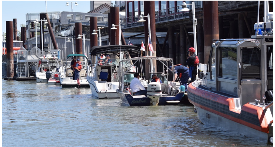
CG Vessels (Auxiliary and Gold Side) docked at Old Sacramento preparing for the "On Water Demonstration".