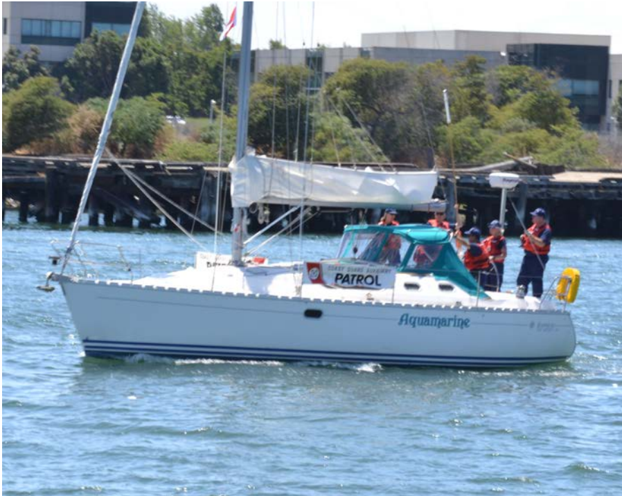
Aquamarine, (Virginia Luchetti, Coxswain) approaching the designated area for towing evolutions.

occurrence but sometimes it is requested and it's better to be prepared.