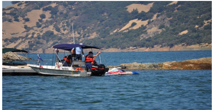
Auxiliary Facility Sea Scum II 171282 with Coxswain Frank Capuro and Crew Pete Van Rij delivering a distressed jet ski to the Lake Sonoma Public Launch Ramp.

This past Fourth of July holiday weekend, the boating activity was intense with one SAR case on July 1, three on July 2, and five on July 3. A typical SAR case is a boat that has mechanical or fuel issues, and we have to tow the boat to one of two launch ramps. This year, on July 2, the first SAR case happened within the first fifteen minutes with Facility Sea Scum II finding a distressed stand up jet ski by the Lake Sonoma Dam.