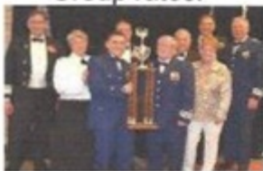
Training, Awards & Fellowship!!!!

Hotel reservations may be made through the District Website or by calling 1-800-648-5080 . Mention "United States Coast Guard Auxiliary" for the Group rates.