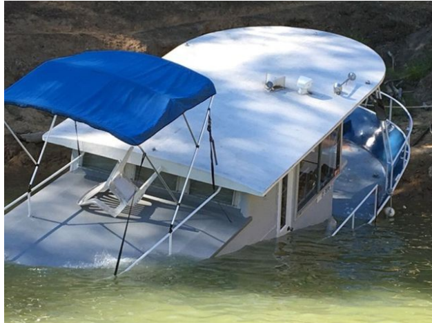
Distressed houseboat assisted to shore by Flotilla 55 just in time.