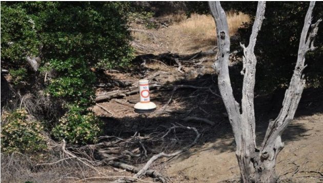
Buoy high and dry, clearly out of place!

The Auxiliary not only assisted boaters during the holiday weekend, but also assisted ACOE manage their buoy system by locating buoys misplaced by the previous high water storms and towing these back to the federal dock for placement at the correct areas.